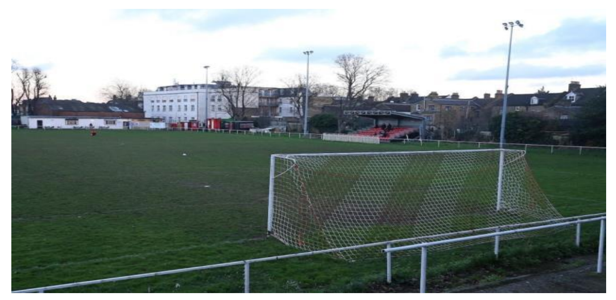
Dutch Euro (New Stand)

Train to Forrest Gate Railway Station then 11 minutes' walk come out of Forest Gate station turn right and walk down Woodgrange Road till the cross roads then turn right along Romford Road then first right into Disraeli Rd the ground entrance is at the bottom of the road.