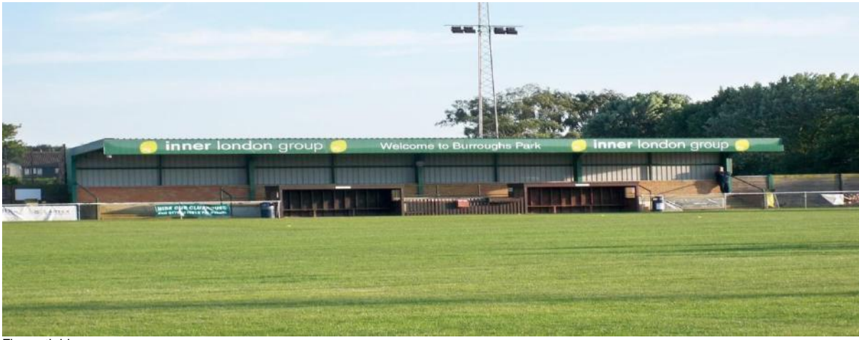
Fly south blog